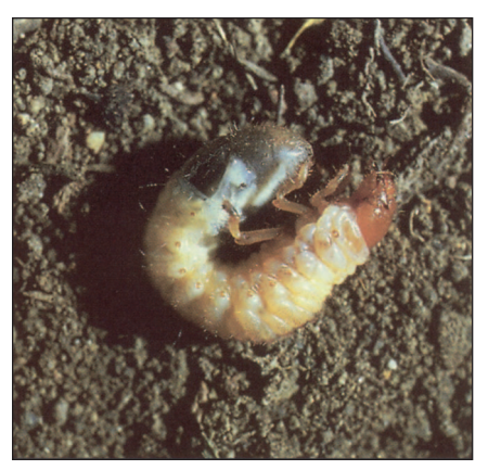
A white grub, larva of Phyllophaga spp. Note creamy white color, dark hind end, brown head, and six well-developed legs. Depending on age, grubs range in length from 1/4 to 11/2 inches.

White grubs feeding on the turfgrass roots can cause either irregular patches or uniformly thin, droughty turf that looks dead. Affected turf often looks like it lacks moisture, even after adequate irrigation or rainfall.