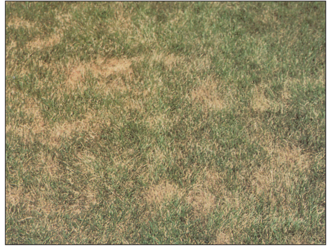
Turf damage caused by white grubs feeding on the root system. Turf looks droughty, even though there may be adequate soil moisture.

Turfgrass roots normally grow rapidly in the spring and fall, and slowly during summer. Therefore, problems with grubs are greatest in summer because roots don't recover normally. Inadequate soil moisture may increase the problem since the few healthy roots have no moisture to take up. For this reason, grub damage typically shows up during the normally drier months of August and early September, although grubs