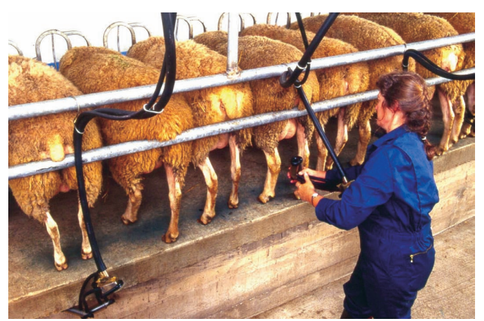
An elevated milking platform

At a minimum, the milking equipment in the parlor will include a vacuum pump and vacuum line, milking claws, and a milking bucket. Milking time is reduced with more milking claws and buckets. Buckets are used to carry milk from the parlor to the milk room. Installing a milk pipeline, which transports milk from the parlor to the bulk tank, reduces labor but increases capital and maintenance costs. In the milk room, the milk is deposited into a bulk tank for cooling. After the milk is cooled, it can be transported to the processing plant or frozen on site.