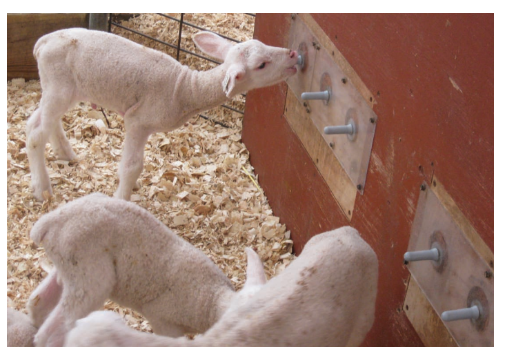
A lamb nursing on milk replacer

Adequate clean water is essential, as milk is 88% water. Lactating ewes have the highest requirement for water of any class of sheep: approximately 3 gallons per ewe per day. A mineral mix with salt formulated specifically for sheep must be offered free choice at all times. It should have no added copper (toxic to sheep) and added selenium (deficient in the Great Lakes region).