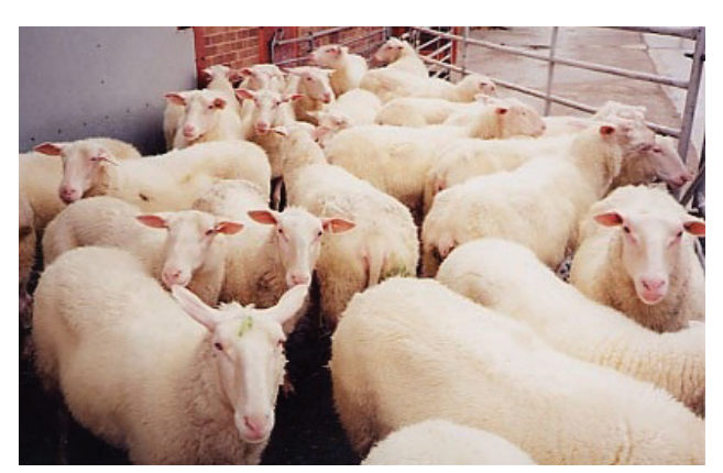
East Friesian dairy ewes

Some non-dairy domestic breeds such as Dorset and Polypay are reasonable milk producers, but the production of these breeds is far below that of specialized dairy breeds.