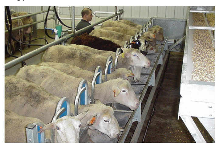
A pit parlor with movable stanchions