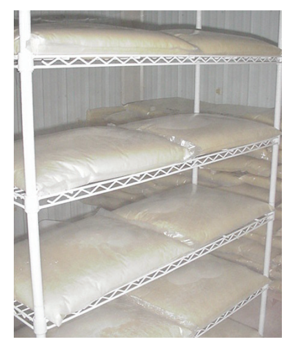
Sheep milk in frozen bags

Health considerations for dairy sheep are similar to sheep raised for meat and wool. Lambs should be vaccinated with a combination vaccine that gives protection against overeating disease and tetanus. Ewes should be given the same vaccine prior to lambing to provide passive immunity to the newborn lambs for these two diseases. Ewes may be vaccinated against abortion diseases and monitored for CL (caseous lymphadenitis, which causes abscessed lymph nodes), a disease detrimental to milk production. Lambs and ewes should be routinely treated for internal parasites, especially while on pasture.