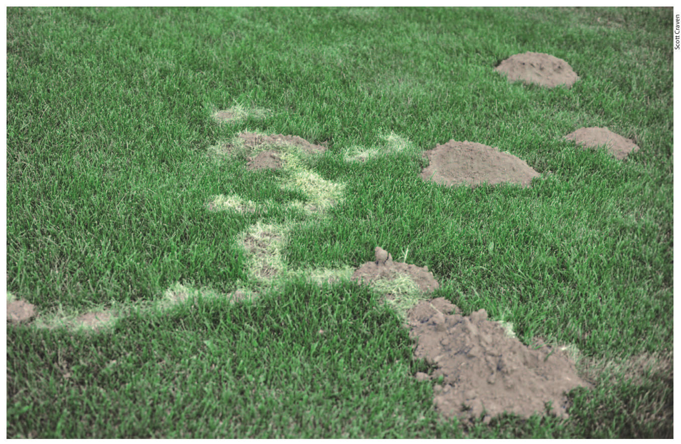
Mole mounds and tunnels.

Furthermore, as soil moisture changes, moles may disappear or reappear as they move down or up, respectively, in the soil column.