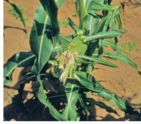
Corn damaged by a raccoon.

For a small plot, construct an inexpensive single strand electric fence using standard fencing wire or a product called electri-cord. The fence does not have to be extremely sturdy, but it is important that the wire be strung eight inches above the soil. Be aware of pets and young kids in the area who may be at risk if they touch the electric fence, and check with