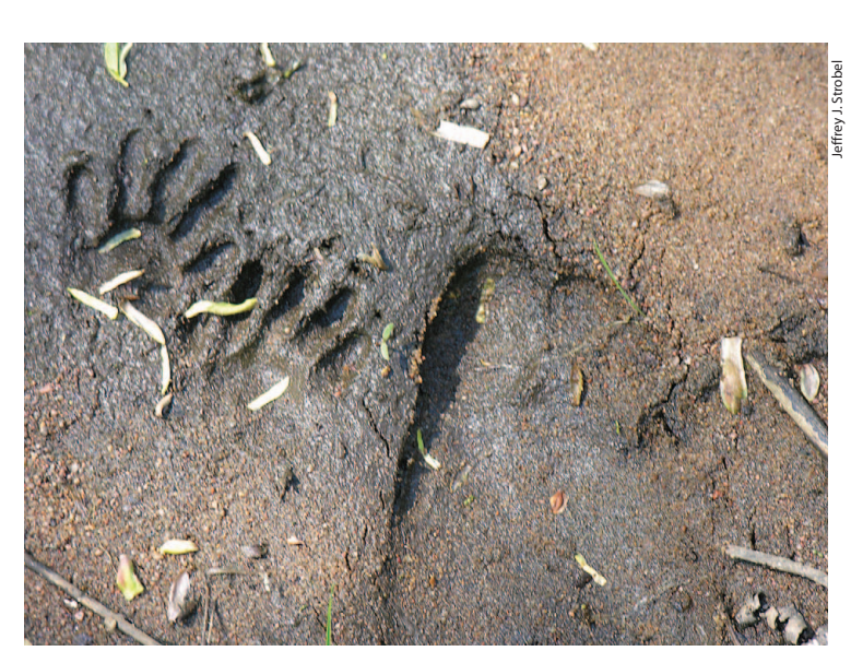
Raccoon and human tracks.

marshes or in agricultural fields. They may also use hollow trees, rock crevices, burrows, caves and buildings. Squirrel leaf nests or large, abandoned bird nests are favorite resting places during spring and autumn. The distances between daily resting sites may be as great as one mile; the same site is seldom used for two consecutive days.